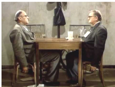
Food, Jan Švankmajer http://www.youtube.com/watch?v=3oOLuBxgYHc